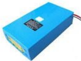
battery without house